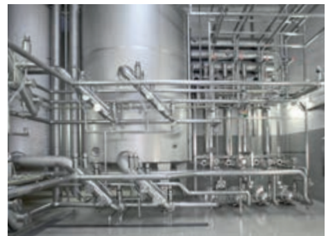
CIP system for syrup room

The KIESELMANN K-Vesselmix nozzle is made of solid material and is e-polished. It is one-piece and completely maintenance-free. For cleaning, the nozzle is simply integrated into the CIP circuit of the tank. In this way, it meets the highest hygiene standards.