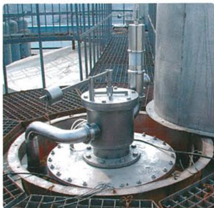
Valves and pipework – Kieselmann specialties and a typical tank top with its cover removed.